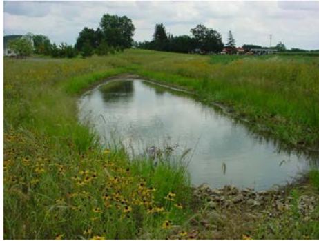
Figure 1. Wet pond